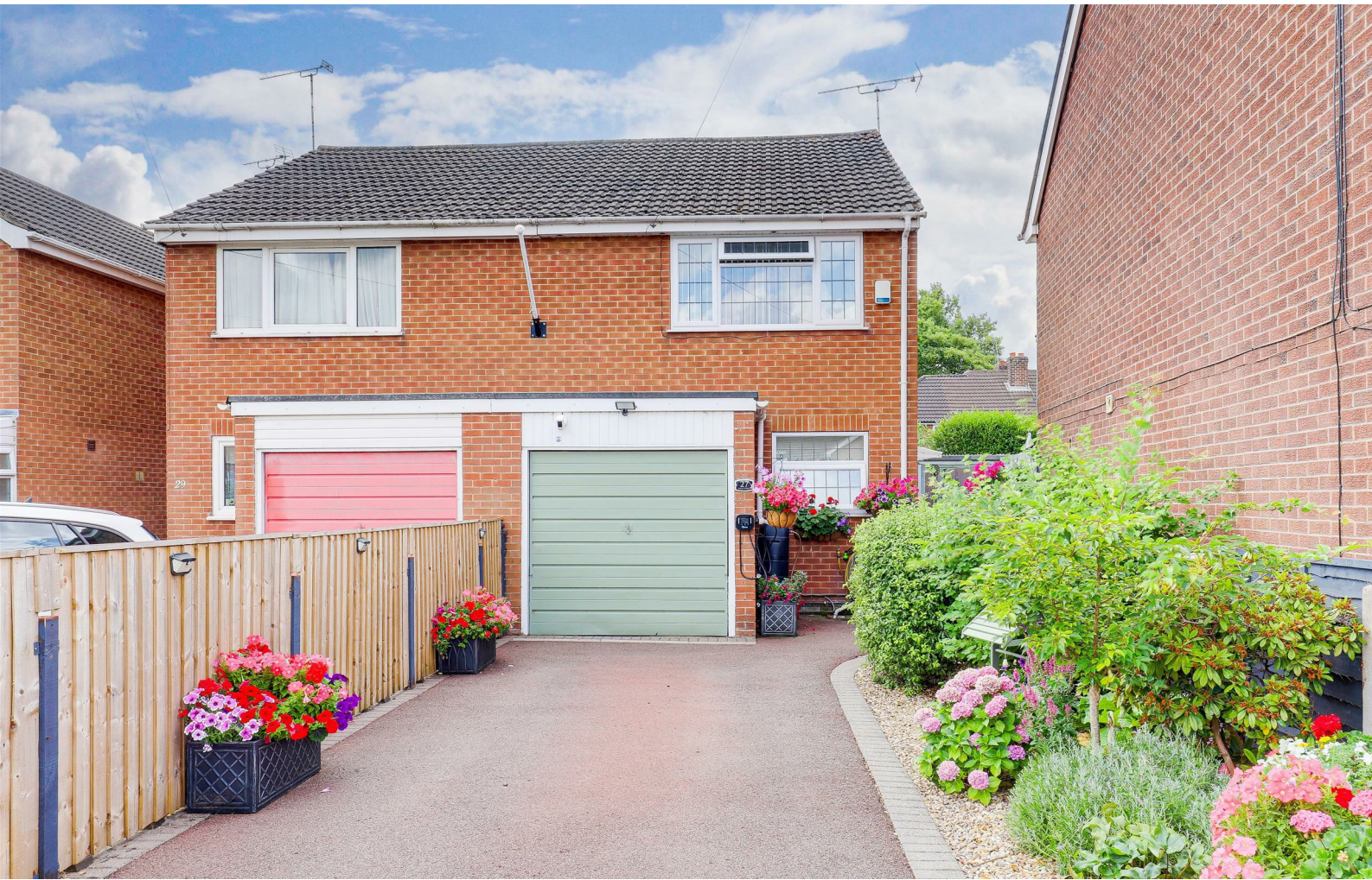
Villa Street, Draycott, Derbyshire DE72 3PZ